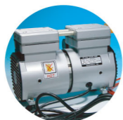
Air Compressor Unit