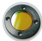
Dust Prevention Window