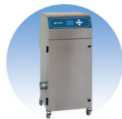
Fume Extraction System